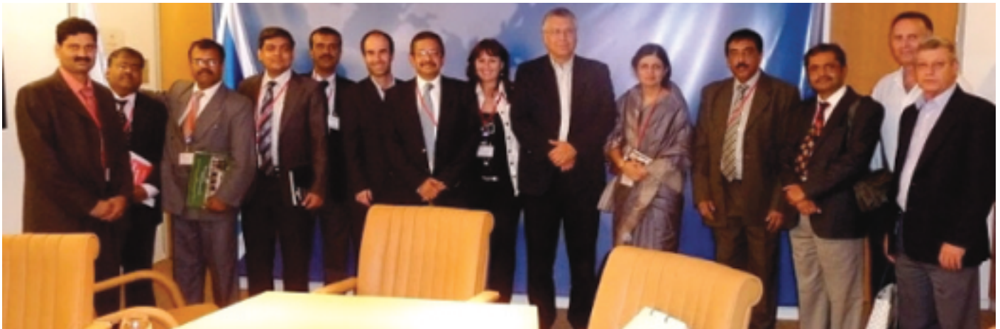
The delegation from Karnataka

The Karnataka State Agricultural Produce Processing and Export Corporation Limited (KAPPEC) signed an MOU with the Israel-Asia Chamber of Commerce (ISASCCI) to enable cooperation in agriculture.