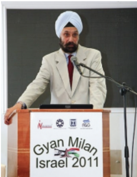
Ambassador addressing the conference

The Israeli Foreign Ministry, the Indian Angel Network and A&G Partners invited to Israel 40 executives from the Cleantech sector, in India from June 19-22, 2011.