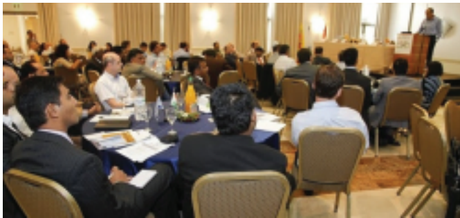
At the business conference

The delegation was introduced to the most advanced technologies in solar energy and water.