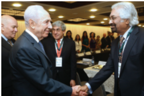
President Shimon Peres and Mr. Sam Pitroda