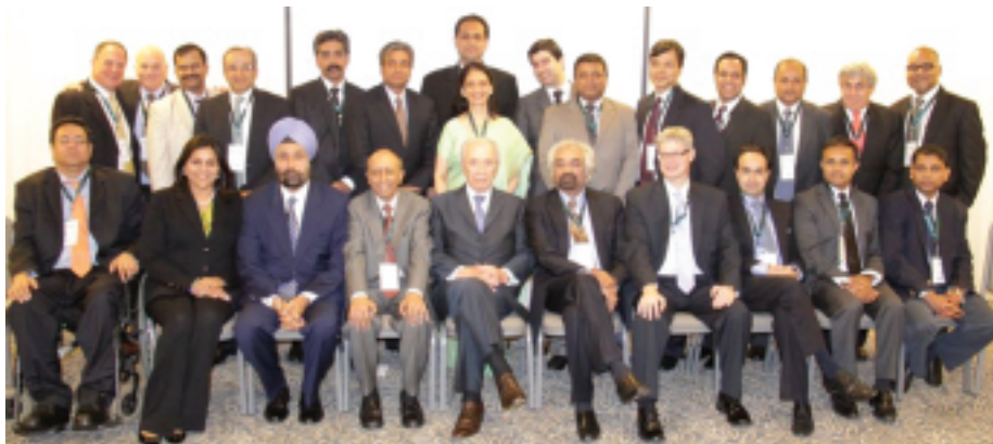
A group photo with President Shimon Peres

The Minister of Homeland Security, Mr. Matan Vilnai, spoke in one of the panels and the Minister of Finance Mr. Yuval Steinitz attended a dinner hosted by Ambassador.