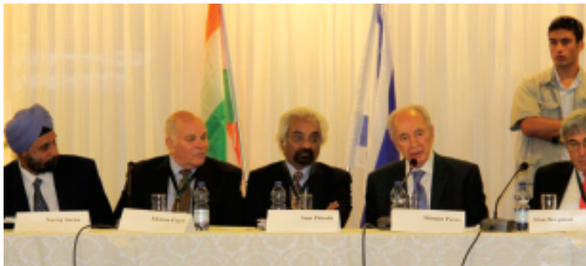
President Shimon Peres addressing the gathering

The fourth Meeting of the India-Israel Forum was held in Tel Aviv from August 31 and September 1, 2011. The Forum is an annual event organized by the Confederation of the Indian Industries and the Tel Aviv University, alternately in New Delhi and Tel Aviv.