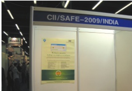
View of the Indian Booth

'Security Israel', The 22nd International Homeland Security Exhibition, was held