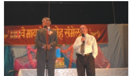
Ambassador addressing the gathering