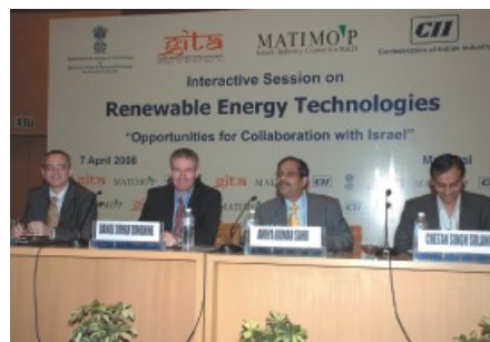
At the interactive seminar on Renewable Energy Technologies in Mumbai

The delegation had several meetings in New Delhi, Mumbai, Chennai and Bangalore. The delegation was given a pre-mission briefing by Ambassador on March 26, 2008. The visit resulted in several tie-ups.