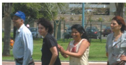
Having fun at the event