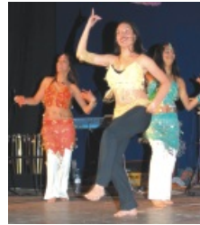
Dance performance at the function

the guests of honour. They also presented certificates of appreciation to some members of the Indian community for their community service.