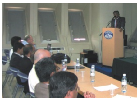
Ambassador addressing the seminar

The India Semiconductor Association (ISA) led a business delegation to Israel from April 14-17, 2008. The purpose of the delegation was to explore opportunities for cooperation and collaboration between Indian and Israeli semiconductor design companies.