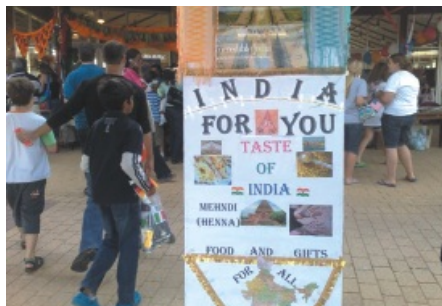
India Booth at International Day at American International School

The American International School in Even Yehuda held its Annual International Day on May 18, 2008. Several Embassies from Israel participated in the event and had country booths. The India booth showcased Indian culture, tourism and ethnic food. Indian students from the school presented an Indian dance item as well as a comedy show using a puppet.