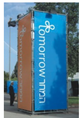
At the venue