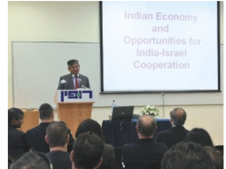
Ambassador addressing the audience at the Ruppin Academic Center

Ruppin Academic Center, Israel organized a half-day Seminar on "India - The Next Challenge" on June 2, 2008. Ambassador gave a presentation on "Indian Economy and Opportunities for India-Israel Cooperation".