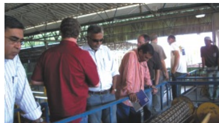
On a field visit

The delegates visited various agricultural sites in Israel to learn about Israeli innovations in production and post-harvest techniques in various vegetable items. The delegation had a meeting with Ambassador on May 20, 2008 where they discussed various possibilities of business cooperation with Israel.