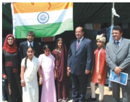
Hon'ble Deputy Foreign Minister of the State of Israel, Mr. Majallie Whbee at the India Booth with school staff and students

Al-Amal Elementary School based in Ramle organized its Annual Cultural Festival on World Culture on June 16, 2008. The event was held in cooperation with the Municipality of Ramle and several embassies. Hon'ble Deputy Foreign Minister of the State of Israel, Mr. Majallie Whbee inaugurated the event. An India booth was set up at the event in order to showcase Indian culture, tourism and food. Counsellor(E&C) represented the Embassy at the event.