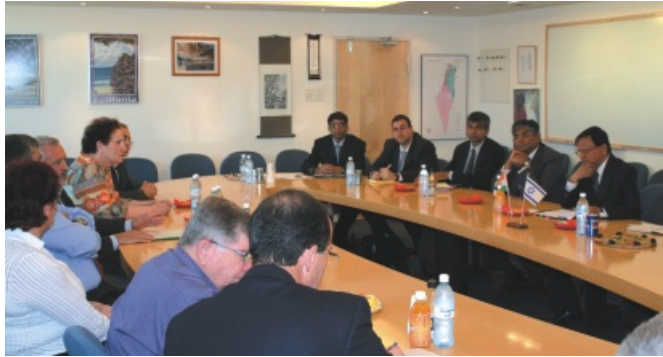
High level Agricultural delegation meeting with their Israeli counterparts (led by Minister of Agriculture Shalom Simhon)