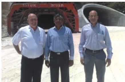
Ambassador at Road No. 6 construction site