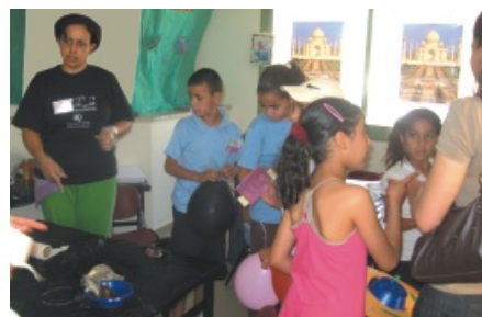
India Booth at Al-Tufula Center

Al-Tufula Center based in Nazareth organized its seventh annual festival called "Around the World" from June 7-9, 2008. The event was held in cooperation with several embassies, the local Municipality and leading businesses and civil society. An India booth was set up at the event in order to showcase Indian culture and tourism. More than 1800 guests participated in the event.