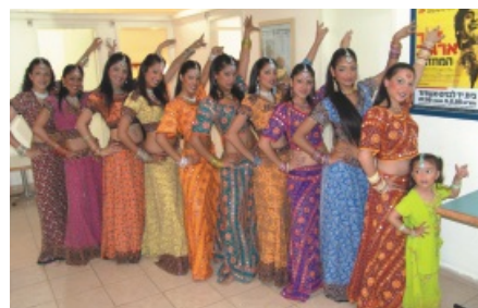
Female artistes of the group

director Adoor Gopalakrishnan. Three Indian films 'Lagaan' (Hindi), 'Nizbalkutta' (Malayalam) and 'Vidheyan' (Malayalam), arranged by the Embassy, were also screened at the festival along with other Indian movies.