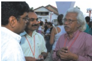
Adoor Gopalakrishnan (on right) in conversation

The 7 th Cinema South International Film Festival - 2008, organized by Sapir College of Ashkelon from June 1-5, 2008, had a special Indian programme, which opened on June 3 with the screening of the film 'Shadow Kill' in the presence of the