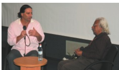
Adoor Gopalakrishnan (at right) during briefing at the screening of the film "Shadow Kill"

The 7 th Cinema South International Film Festival - 2008, organized by Sapir College of Ashkelon from June 1-5, 2008, had a special Indian programme, which opened on June 3 with the screening of the film 'Shadow Kill' in the presence of the