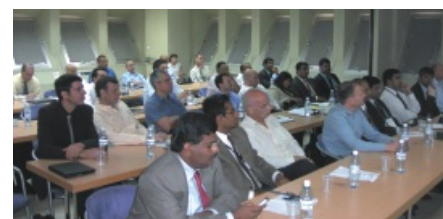
View of the participants