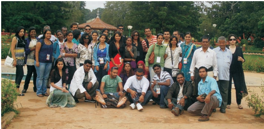
Group picture of 12th KIP participants

Four Israeli youth (2 girls and 2 boys) of Indian origin participated in the 12th Know India Programme (KIP) from September 25 - October 15, 2009 organised by the Ministry of Overseas Indian Affairs, Government of India, in partnership with Confederation of Indian Industry (CII). They were joined by participants from all over the world. The participants were taken to Karnataka and Himachal Pradesh as a part of the KIP programme. They also visited Delhi and Agra apart from various places of interest in Karnataka and Himachal Pradesh. The participants were exposed to various facets of modern India and were also familiarized with Indian history, culture and heritage during the three week