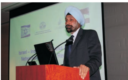
Ambassador addressing the gathering