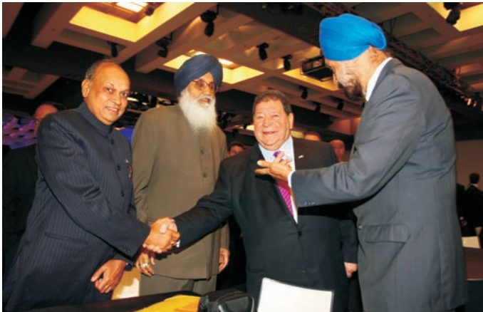
From R to L: Ambassador, Binyamin (Fuad) Ben Eliezer - Israeli Minister of Industry, Trade and Labor; Mr. Parkash Singh Badal - Chief Minister of the State of Punjab and Prof. Prem Kumar Dhumal - Chief Minister of the State of Himachal Pradesh