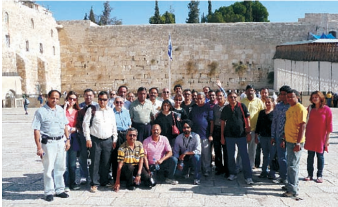
A group photo of the delegation

Chamber of Commerce. The visit included a two-day Conference and Workshop which explored new and transformational technologies and included presentations by leading Israeli and Indian technology experts and representatives from leading Israeli IT companies. In addition, the delegation visited leading companies and R&D