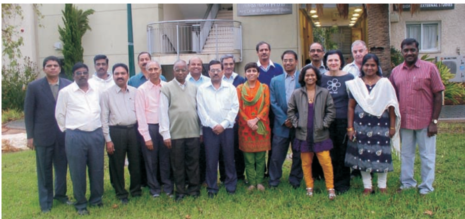
A group photo of the delegation

The delegation also visited various sites such as pomegranate orchards; mango plantation and cultivation; mango nurseries; packing houses for bananas and mangoes; seeds breeding and production; greenhouses and net houses.