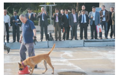
Demonstrations of Dog Squad