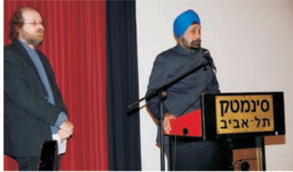
Ambassador addressing the audience at the inaugural show at Tel Aviv Cinematheque

The Embassy of India organized an Indian Film Festival from December 7-26, 2009. The festival, supported by the Indian Council for Cultural Relations (ICCR) and Directorate of Film Festival (DFF), was held in collaboration with the Cinematheques of Tel Aviv, Jerusalem and Haifa.