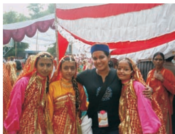
A delegate with a folk dance troupe

programme. They also got an opportunity to meet the President of India, Smt. Pratibha Devisingh Patil at Rashtrapati Bhavan and other high dignitaries during the programme. The KIP provides a unique forum for youth of Indian origin to visit India, share their views, expectations/experiences and bond closely with contemporary India.