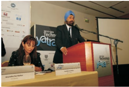
Ambassador addressing the gathering

A delegation comprising 44 senior CTOs and CIOs of leading Indian companies visited Israel from November 8 -11 to participate in the India - Israel Technology Forum - Yatra (Yatra is an initiative of the CTO Forum of India). The event was organized by A&G Partners in cooperation with the Israel - Asia