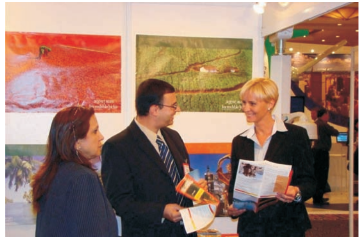
The Indian Booth at Israel Gateway 2009

"Israel Gateway 2009" (Israel's 7th foreign trade convention) and the 1st "Safe City Conference" organized by the Globus Gate Group Limited were held from November 30 – December 1, 2009 at the David Intercontinental Hotel, Tel Aviv. Israel Gateway is an annual event which is attended by various embassies,