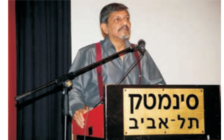
Amol Palekar addressing the audience in Tel Aviv

cinema and reflected on the evolution of Indian cinema and its richness today. Cocktail receptions preceded the inaugurals at Tel Aviv and Jerusalem. The film festival generated a huge response and excitement among the Israeli people, including the Indian community. All the films shown in the three Cinematheques were attended by capacity crowds. Presence of film personalities – Mr. Anupam Kher and Mr. Amol Palekar – was very well received and was the highlight of the film festival. This year's film festival