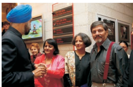
At the reception at Tel Aviv Cinematheque

The inaugural function was held on December 7, 2009 at Tel Aviv Cinematheque to a packed audience with the screening of Hindi film "A Wednesday". More than 350 people attended the inaugural screenings of "Anaahat" subsequently held at the Jerusalem Cinematheque on December 8 and Haifa Cinematheque on December 10. Mr. Anupam Kher and Mr. Amol Palekar addressed the audience and spoke on their experiences in film industry and